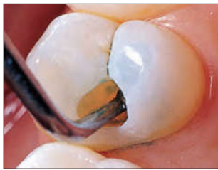
3. Remove green-black color (carious dentin) with slow-speed round bur or excavator. To control overexcavating near the pulp, remove final portion of caries with hand excavator.