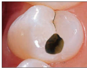
2. Rinse with air/water and suction. Caries dentin is easily identified.