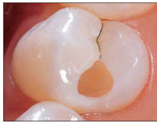
4. Reapply. Rinse and verify complete caries removal.