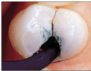
1. Apply Sable Seek indicator with Black Mini Brush tip.

Seek and Sable Seek caries indicators stain demineralized dentin in difficult-to-see places—for example, under the overhanging enamel of Class I, II, or III preparations, or along the DE junction of the preparation. Green Sable Seek caries indicator helps prevent overexcavating deep caries, which can lead to pulp exposure. Non-mineral dentin should be removed to improve the bond strength of the entire restoration, and is easily visible on dark dentin and provides a fast, effective way to locate calcified root canal orifices.